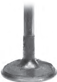
Intake Valve after P.i. Treatment