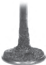
Intake Valve before P.i. Treatment