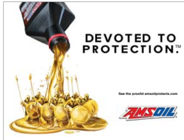
Window Decal 9"x12" (G3356)