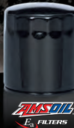
AMSOIL E 3 FILTERS