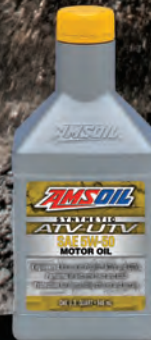
SYNTHETIC MOTOR OIL