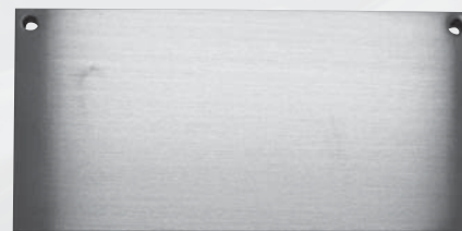
AMSOIL Firearm Cleaner (no corrosion)