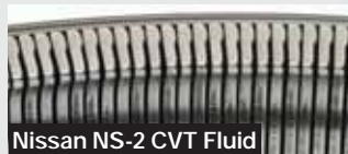
Nissan NS-2 CVT Fluid