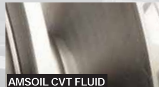
AMSOIL CVT FLUID

Order by Phone 1-800-956-5695 - Give Operator Reference #5372670