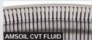
AMSOIL CVT FLUID