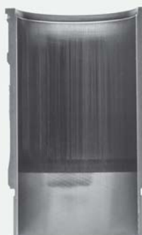
Severely Scuffed Liner