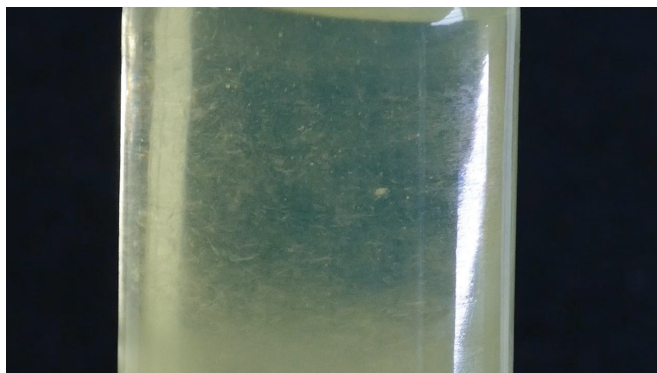
Wax crystals in untreated diesel fuel. The wax crystals will eventually fall out of solution and plug the fuel filter.