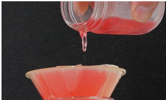
Wax formation in untreated diesel fuel resists pouring.

lowers the cold filter-plugging point (CFPP) by up to 40°F (22°C) in ULSD.