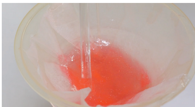
Wax formation in untreated diesel fuel plugs a coffee filter.