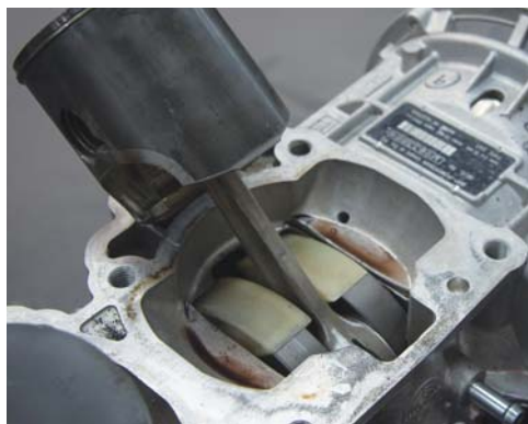
The pistons suffered only minor scuffing.